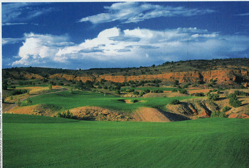
You'll have your hands full with beautiful Twin Warriors in New Mexico.