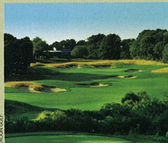
Ocean Edge Resort is a Cape Cod gem.

Green fees: $110-$145; For tee times call 508-896-9000 or visit oceanedge.com