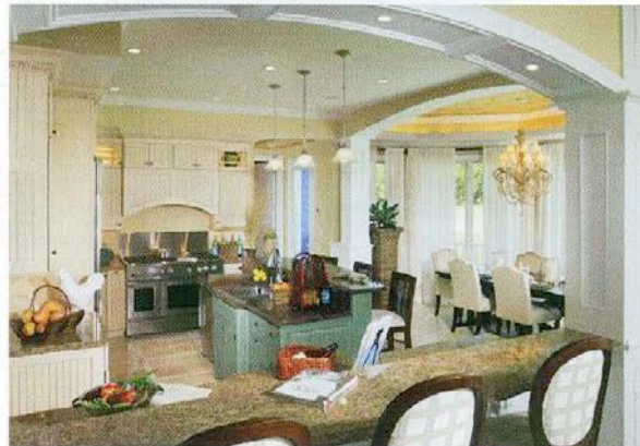
Many of The Peninsula's custom homes feature stunning golf course, river or bay views, as well as spacious kitchens with adjoining fine dining rooms.