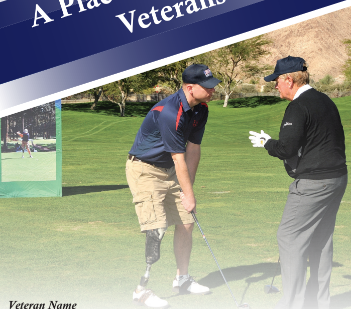
Veteran Name & Golf Legend Jack Nicklaus