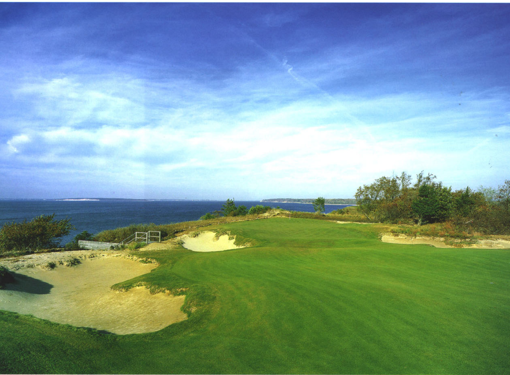
The layout at Sebonack includes a spare or betting hole - the par three 19th plays towards the bay with Cow Neck in the distance.

TD: We still have a second 18 holes to build at St. Andrews Beach in Victoria. With luck, we'll be halfway finished by the time this journal is in your readers' hands.