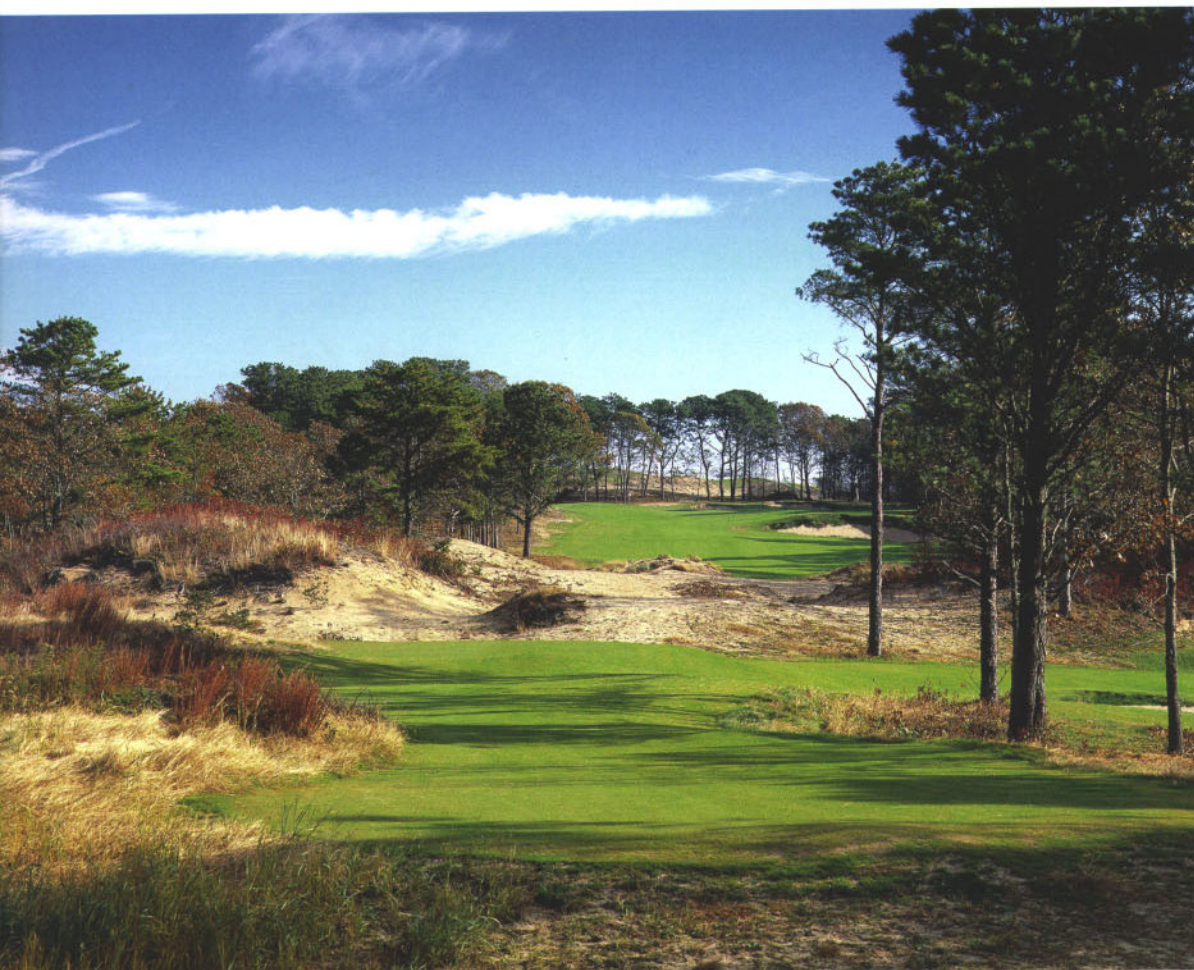
The teeing ground for the uphill par four 16th is set amongst natural dunes and adjoins the 12th tee.