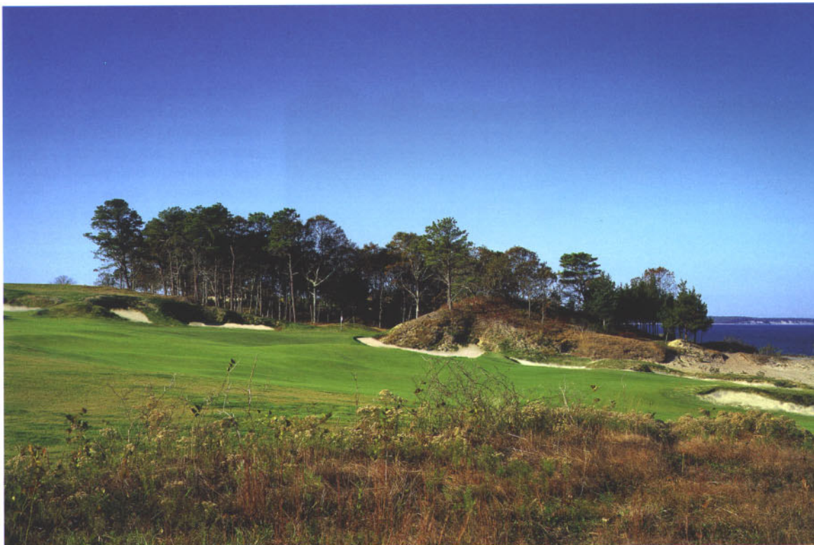
The green for the second hole is tucked between large sand dunes.

But we didn't divide up the design work in any way - everyone had their say on every hole.